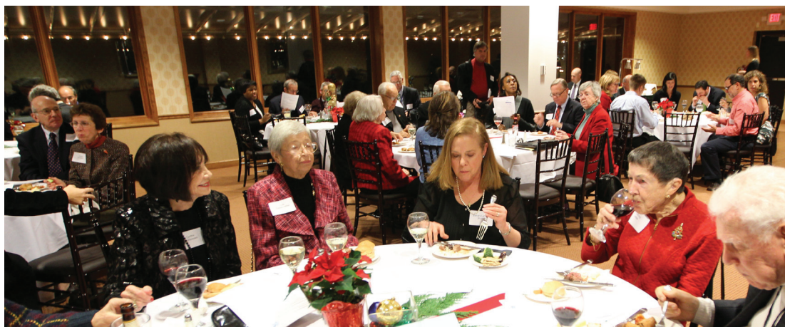
Fifty-two members and guests attended the annual meeting at The Forest Park Highlands

Press Club members and guests shared an evening of camaraderie and festivity at our 55th annual meeting held December 12.