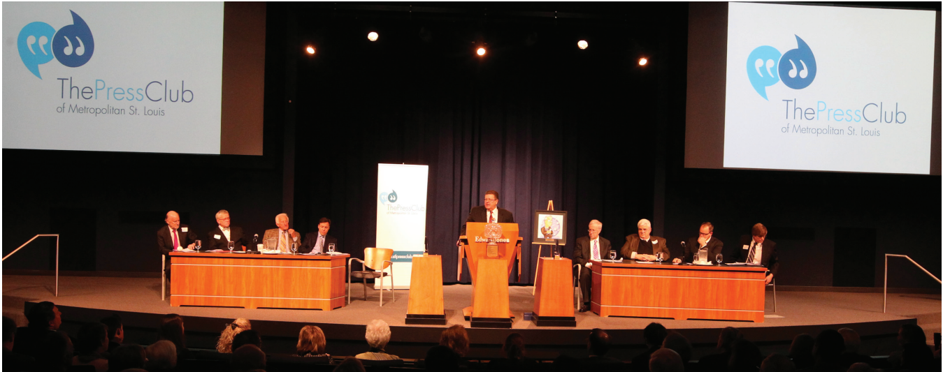
Presenters and honorees at Press Club Media Person of the Year Program.