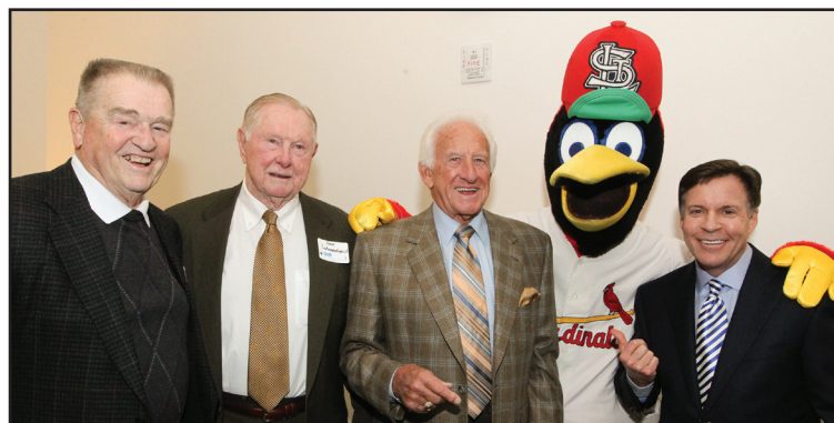
From left: Whitey Herzog, Red Schoendienst, Bob Uecker, Fredbird and Bob Costas at the Press Club Media Person of the Year Gala.